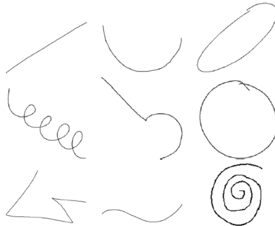
Figure 1: Low-level primitive recognition.

which are used by higher-level sketch recognition systems as building blocks to form more complex symbols. Common primitives include lines, arcs, polylines, and ellipses [SSD01, YC03]. More recent algorithms have also expanded their primitive lists to include other shapes like curves, helices, spirals, etc. [PH08]. See Figure 1